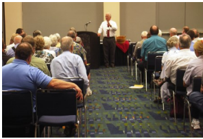
Annual Conference

The ways a church can get involved are growing. Listening to the needs of pastors and churches, the Springs Academy was created so pastors would have an understanding of how to help their church renew.